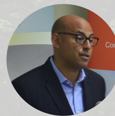
Sen. the Hon. Simon Stiel Minister for Climate Resilience, the Environment, Forestry, Fisheries, Disaster Management and Information

"The process of developing the National Adaptation Plan (NAP) has been conducted with the input of more than 160 stakeholders and experts from all climate related fields, thereby taking advantage of recent studies as well as ensuring alignment with ongoing processes such as the development of Grenada's Second National Communication and the National Sustainable Development Plan 2030."